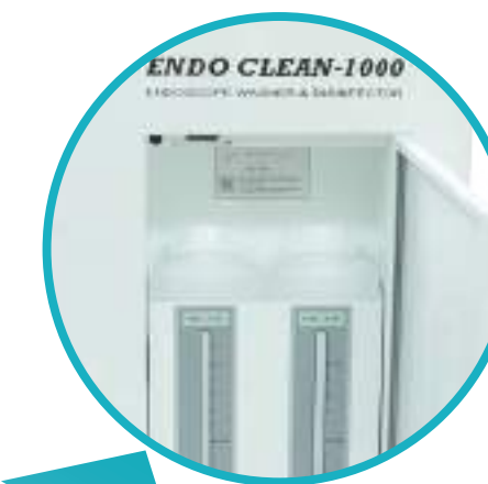
Providing effective disinfection capability with detergent and alcohol added.