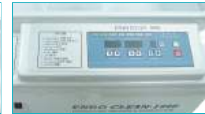
Program mode selection type which is easy to be operated.