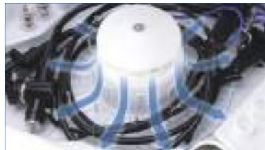
Rapid drying basin and surface of endoscope by strong air shower