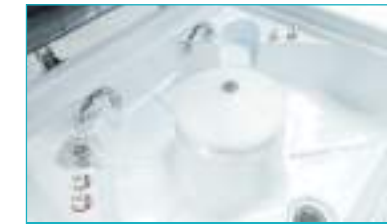
Strong multiple 3 channel 360° rotating nozzle type