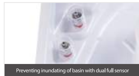
Preventing inundating of basin with dual full sensor