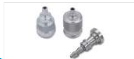
Providing OLYMPUS, PENTAX, FUJINON leak test adaptor.