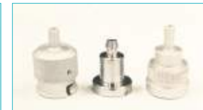
Providing OLYMPUS, PENTAX, FUJINON leak test adaptor.